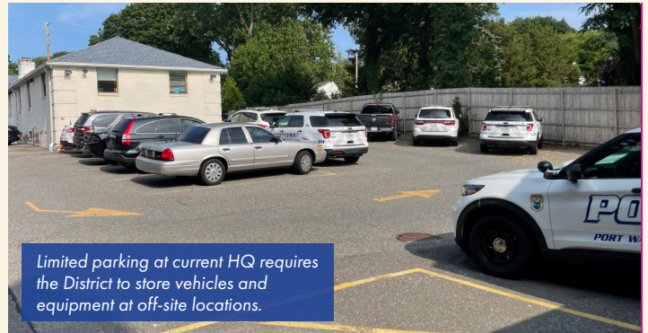
Limited parking at current HQ requires the District to store vehicles and equipment at off-site locations.

Once the new headquarters is fully operational, the existing property will be put on the market for sale. The proceeds from the sale of the current property will be used to offset some of the costs associated with purchasing the property for the new headquarters.