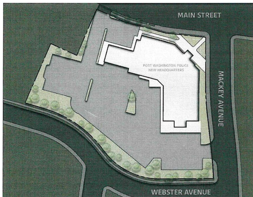
Caption: Site map of the proposed new headquarters building placement and preliminary design for the overall property.

“The proposed positioning of the building will not only ensure this building is visible and easily identifiable from main street, but ensure its footprint exists on the portions of the property that are commercially zoned,” said PWRD Commissioner Sean McCarthy. “Our goal with the site plan and with all of the screening and buffers to be developed is to limit the visual impacts to surrounding neighbors as much as possible, while also ensuring the design of the new facility matches the charm and character of Port Washington.”